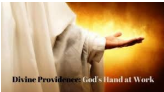
Divine Providence: God's Hand at Work